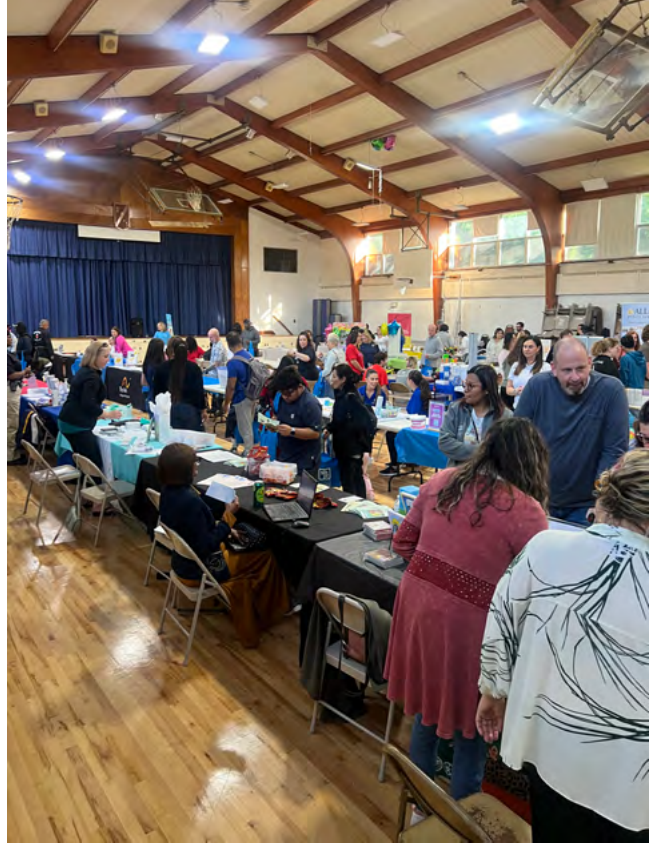
SBJC's Parent Committee held its first Information Night, a community resource vendor fair for families to learn all about local vendors and organizations providing resources for students.