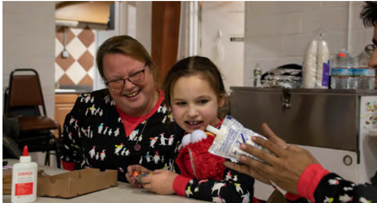
SBJC's Parent Committee held its first Family Night, with dozens of families coming together to create gingerbread houses, complete crafts, and celebrate the winter.